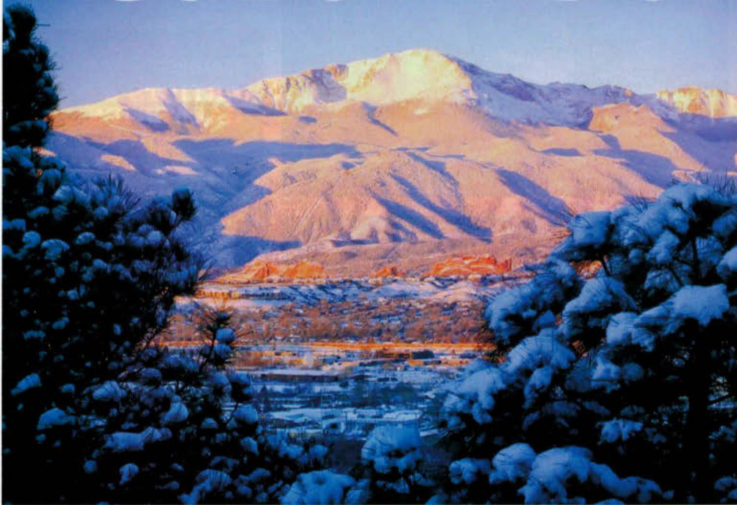
Wintery Pikes Peak.

W ith an abundance of natural beauty, Colorado is unquestionably a destination for artistic inspiration and for outdoor adventures. The Southwestern state is filled with natural wonders such as the Rocky Mountains, Pueblo dwellings, several national forests and a diverse landscape that includes snow-capped peaks, rushing rivers and desert scenery. Such splendor has culminated in lively arts centers, events, museums and galleries in the Western genre. From the vibrant capital of Denver, to the smaller winter destinations of Vail and