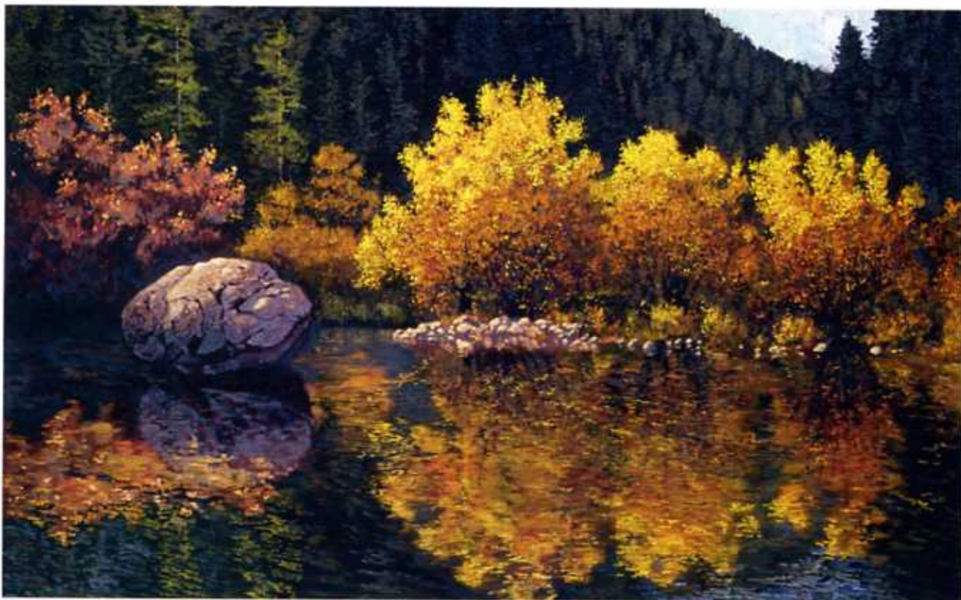
TIM SASKA, AUTUMN REFLECTIONS, ACRYLIC, 36 X 60"