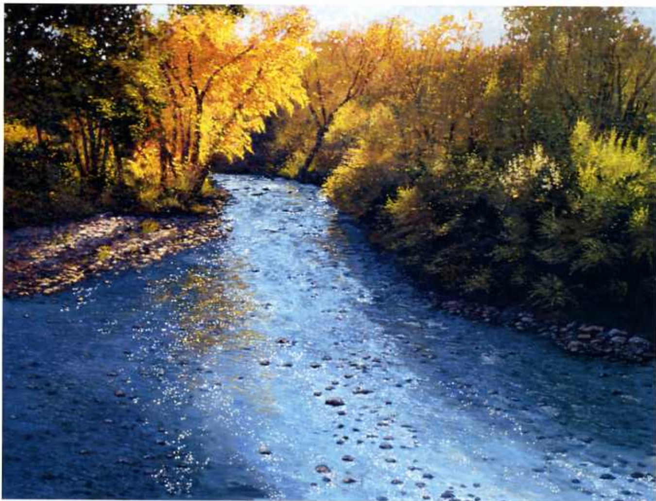
TIM SASKA, COTTONWOD CREEK, ACRYLIC, 48 X 60"

studies to plan out the final outcome. Instead, I begin by drawing with paint in the first layer, making many compositional decisions in this stage."