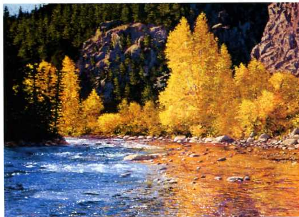
HEATHER FOSTER, THE PATH AHEAD , OIL ON BOARD, 40 X 48"

This group was just hanging out, watching the cars go by and wondering where all those people were going in such a hurry, when I distracted them. I wanted to include the evidence of the way they travel in a single line.